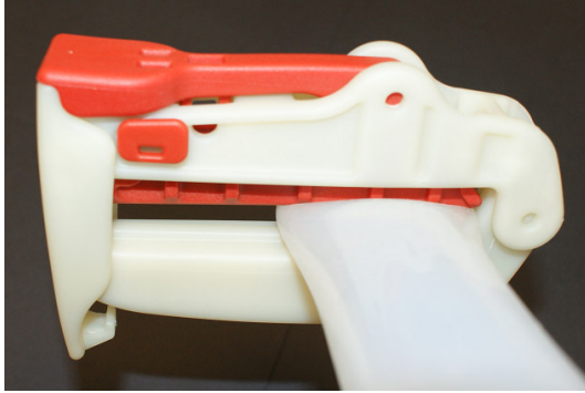
HWC set to Stop Flow without Cable-Tie