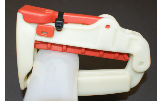
HWC Start Flow with Cable-Tie Lockout