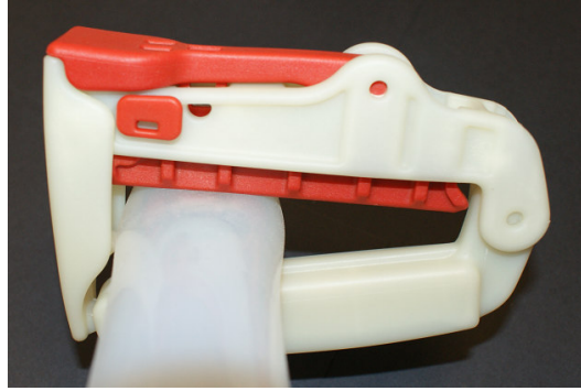
HWC set to Start Flow without Cable-Tie