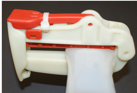
HWC Stop Flow with Cable-Tie Lockout-2