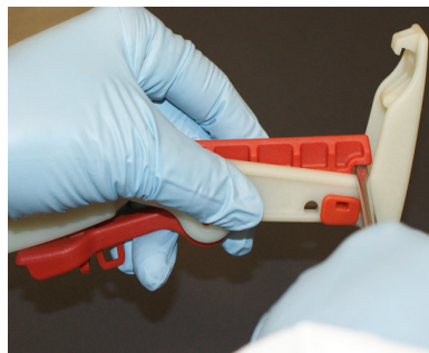
2. Using a straight bladed driver place screw-driver under Gate