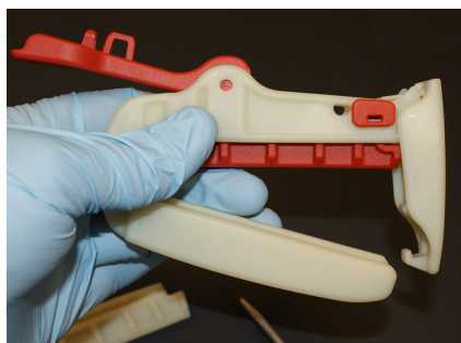
1. Starting with the HWC in the open position, turn upside-down

Gate removal and replacement instructions for the HWC: