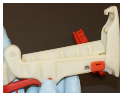
7. Gate shown properly installed and ready to return to service