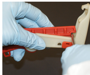
3. Rotate the blade clockwise and Gate will lift from receiver