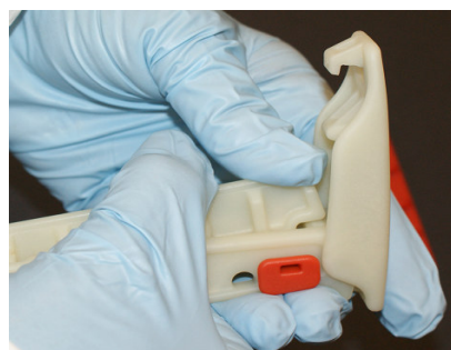
6. Use the thumbs of both hands to press the Gate into place