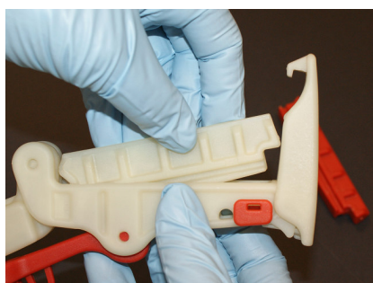
5. Place required Gate into the receiver, note notch forward