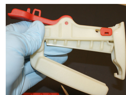
8. HWC shown with White Gate ready to seal 1/8" – 1/4" wall tubing

To open or close the HWC refer to the Quick Start guides for that operation. HWC can be ordered with both Gates using P/N: HWC-RG-WG.